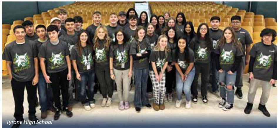
Tyrone High School