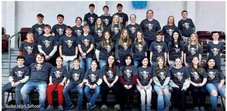
Balko High School