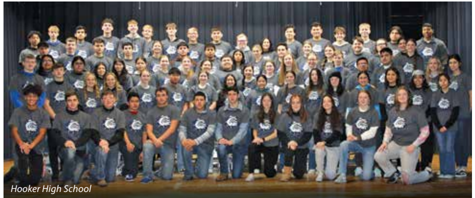
Hooker High School

Congratulations to all honor roll T-shirt recipients! PTCI is honored to honor you!