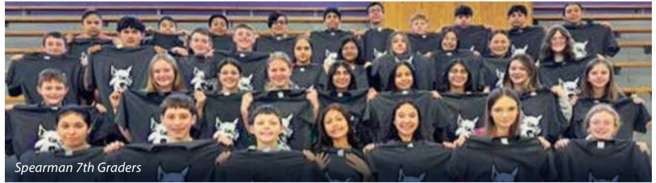
Spearman 7th Graders

Congratulations to all honor roll T-shirt recipients! PTCI is honored to honor you!