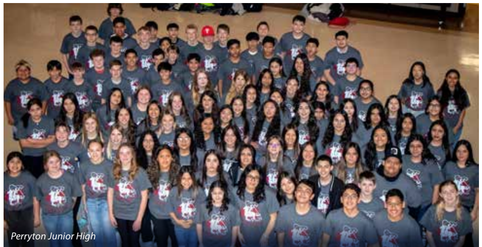
Perryton Junior High