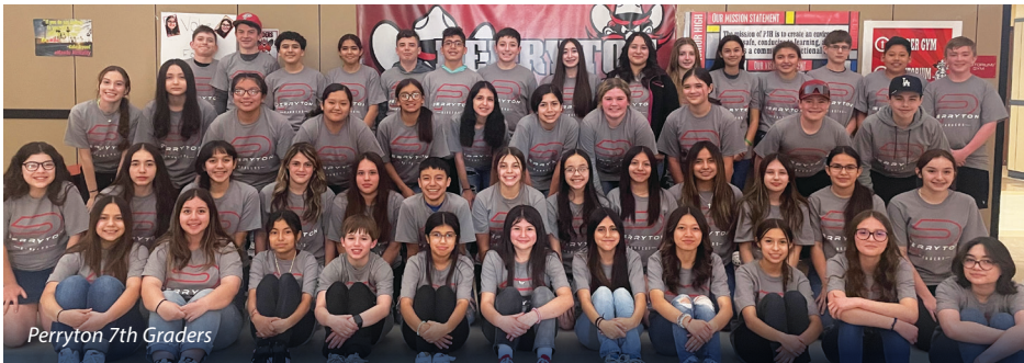
Perryton 7th Graders

April 7 - Good Friday May 29 - Memorial Day