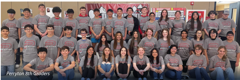
Perryton 8th Graders