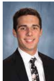
Robert Harper Gruver High School