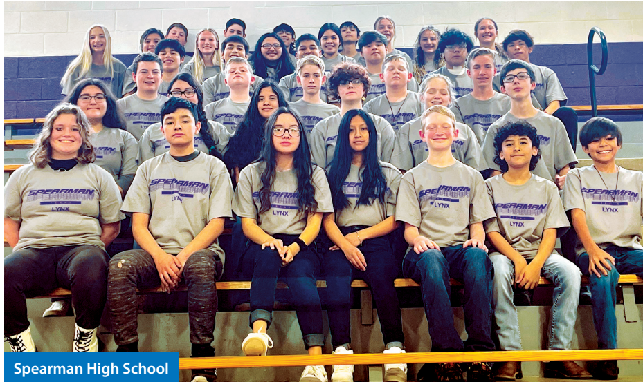
Spearman High School