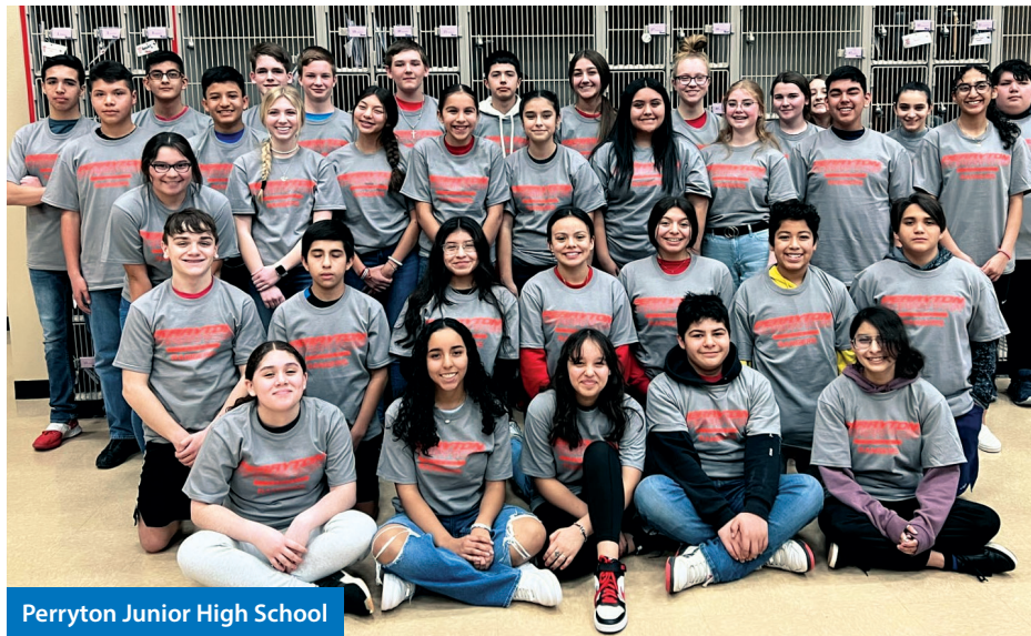
Perryton Junior High School

High School and Junior High School Honor Roll students from across PTCI's coverage area show off their new, free T-shirts from PTCI. Students in PTCI's service area, grades 7 through 12, who made their schools' honor rolls received custom-made T-shirts. PTCI rewards students who make good grades with school-themed shirts. Congratulations to our area's hard-working students!