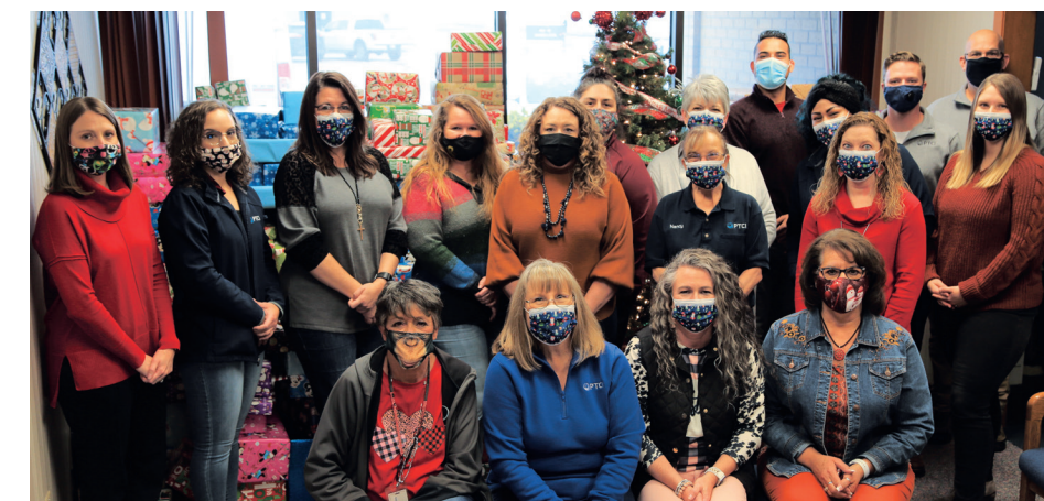
A portion of the PTCI employees that donated to the Christmas Cheer for Children program gather with the wrapped gifts right before they were delivered to Hitch for distribution to deserving children.